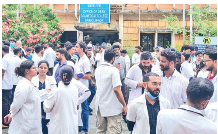
Doctors gather outside the Dean's office to demand a public apology from the Minister inside the GMC complex, on Monday

Looking to sell your used gadgets, bikes, furniture, or even a car? or searching for great deal near you? Our new app makes buying and selling simple and convenient!