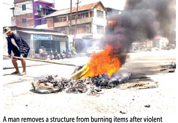
protests erupted in Manipur over the arrest of a leader of Meitei outfit Arambai Tenggol, in Imphal, Manipu

Prohibitory orders have been clamped in Imphal West, Imphal East, Thoubal, Bishnupur and Kakching