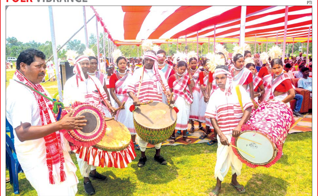
Tribal artists perform a traditional dance during the 'Pahan' (Tribal Priest) convention, in Ranchi