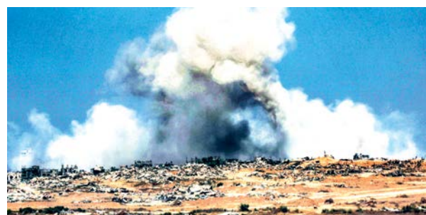
A plume of smoke erupts during Israeli bombardment in the Gaza Strip as pictured from across the border in southern Israel, amid the ongoing war between Israel and Hamas

The shooting deaths were the latest reported near the aid centre run by the Gaza Humanitarian