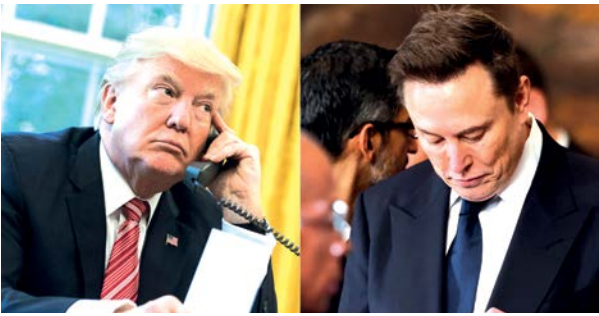
The fallout between Trump and Musk has been marked by escalating tensions and public disputes

The Tesla car company is the cornerstone of Musk's business empire and has suffered considerably since the entrepreneur dove into politics. The electric vehicle giant's stock has plummeted more than 20 percent