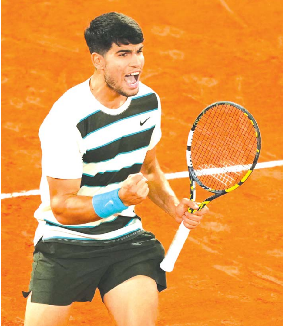
Spain's Carlos Alcaraz reacts to a point as he plays against Italy's Lorenzo Musetti during their men's singles semi-final match on Day 13 of the French Open tennis tournament on Court Philippe-Chatrier at the Roland-Garros Complex in Paris on Friday

the last four without dropping a set while Djokovic impressed in a four-set win over last year's runner-up