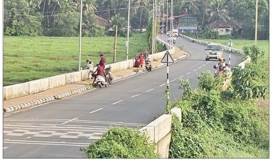
Boys gather alongside the Gaunsa vaddo Siolim link road to catch fish from the flooded fields below. The marshy water bodies are now teeming with invasive catfish and tilapia, which are a popular protein-rich fried snack during the monsoon

ment and revenue generation," the Society stated.