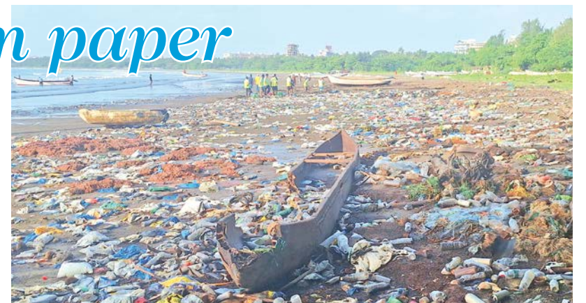
(Above) Caranzalem beach littered with plastic waste. (Left) Rampant use of plastic bags by vendors as well as customers continues at CCP market, Panjim

consumer behaviour. "Customers often come empty-handed and refuse to buy if we don't give them plastic bags," said a vegetable vendor. "Only a few bring their own. People don't understand how harmful plastic is."