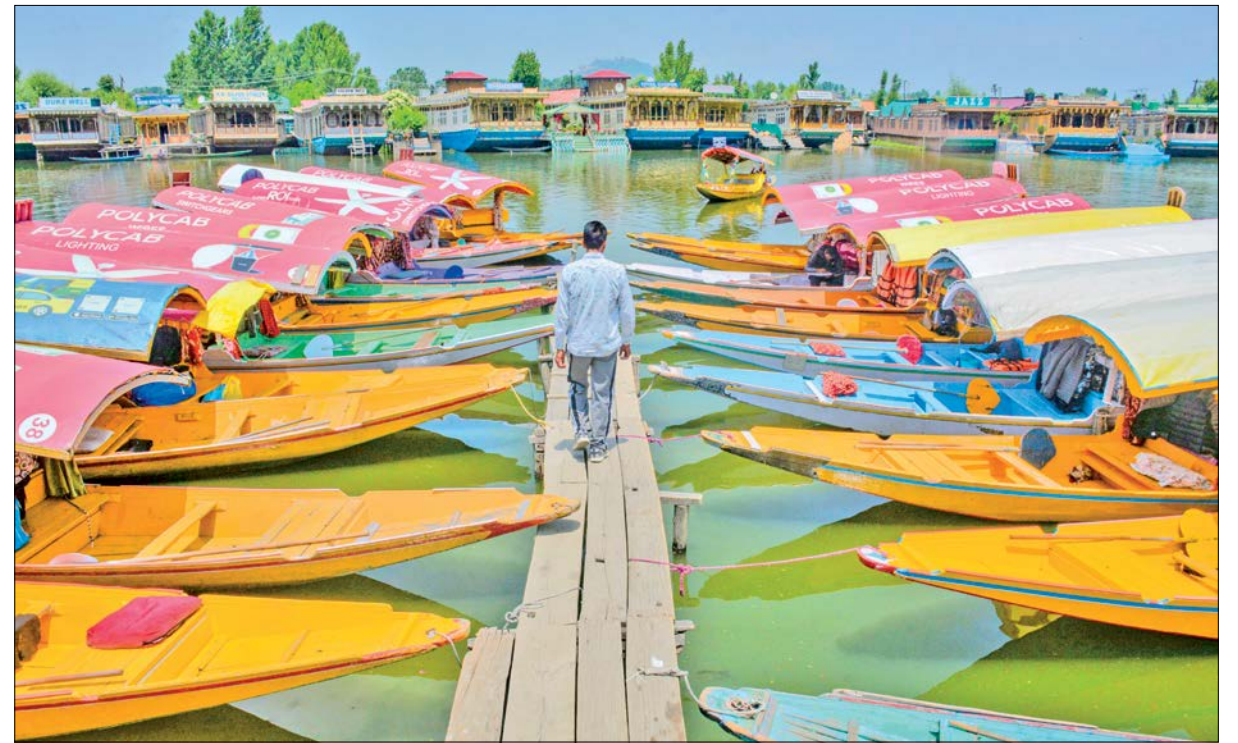
A Shikarawala near parked Shikaras at Dal Lake as Kashmir continues to see low footfall of tourists, in Srinagar, on Thursday