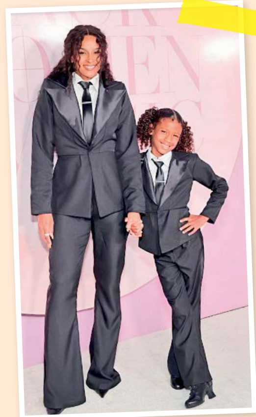
Ciara and daughter Sienna wow in matching black-and-white suits at the Black Women in Music Dinner. The stylish duo lit up the June 3 event in L.A., where Ciara was honoured for her impact in music.