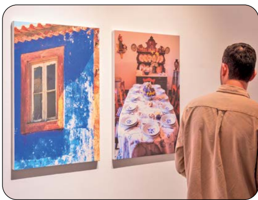
A VISUAL DIALOGUE BETWEEN PORTUGAL AND INDIA THROUGH PAULO NABAIS' LENS