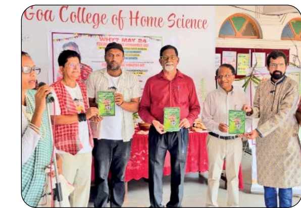
'HEALING WONDERS OF MEDICINAL PLANTS IN GOA' SHINES LIGHT ON TRADITIONAL REMEDIES