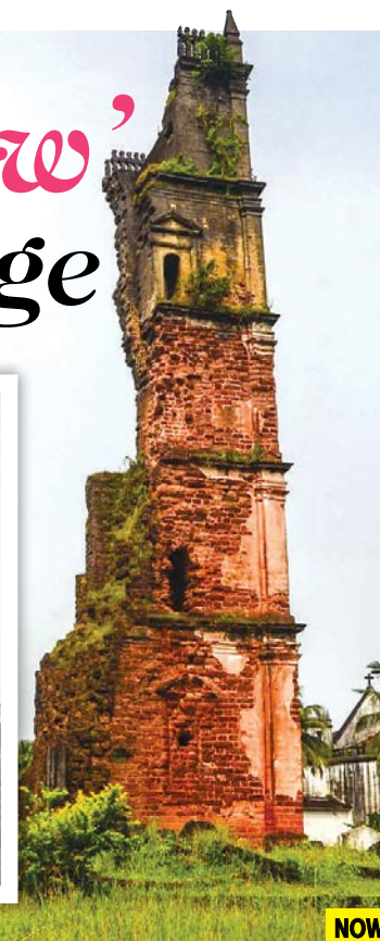
Ruins of Church of St Augustine