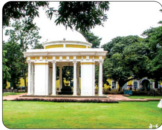
A TIME CAPSULE: 'GOA THEN AND NOW' EXHIBITION SHOWCASES 125 YEARS OF CHANGE