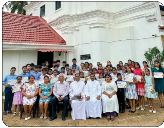
ROMI KONKANI COURSE CERTIFICATE DISTRIBUTED AT AROSSIM-CANSAULIM