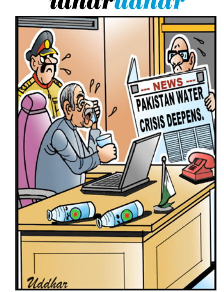
Forget drones and missiles send water tankers instead.

MAX. TEMP 32.6 °C MIN. TEMP 24.5 °C idharudhar