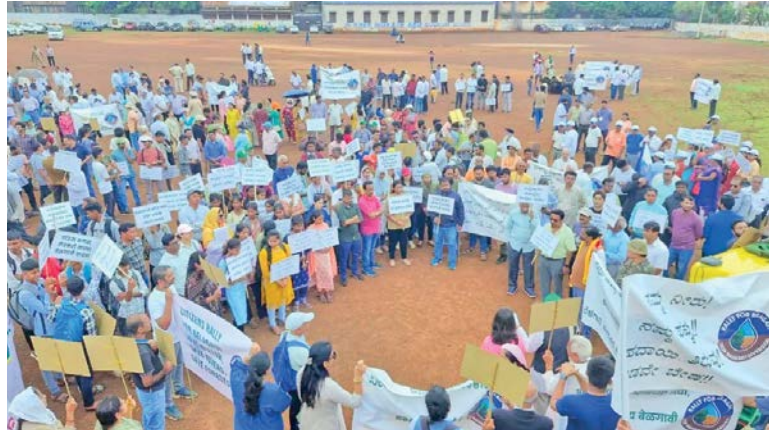
Environmentalists protest against the Kalsa-Bhandura water diversion project in Karnataka's Belagavi district, on Tuesday

Activists gather for protests in Panjim and Belagavi; say river diversion will spell doom for Western Ghats