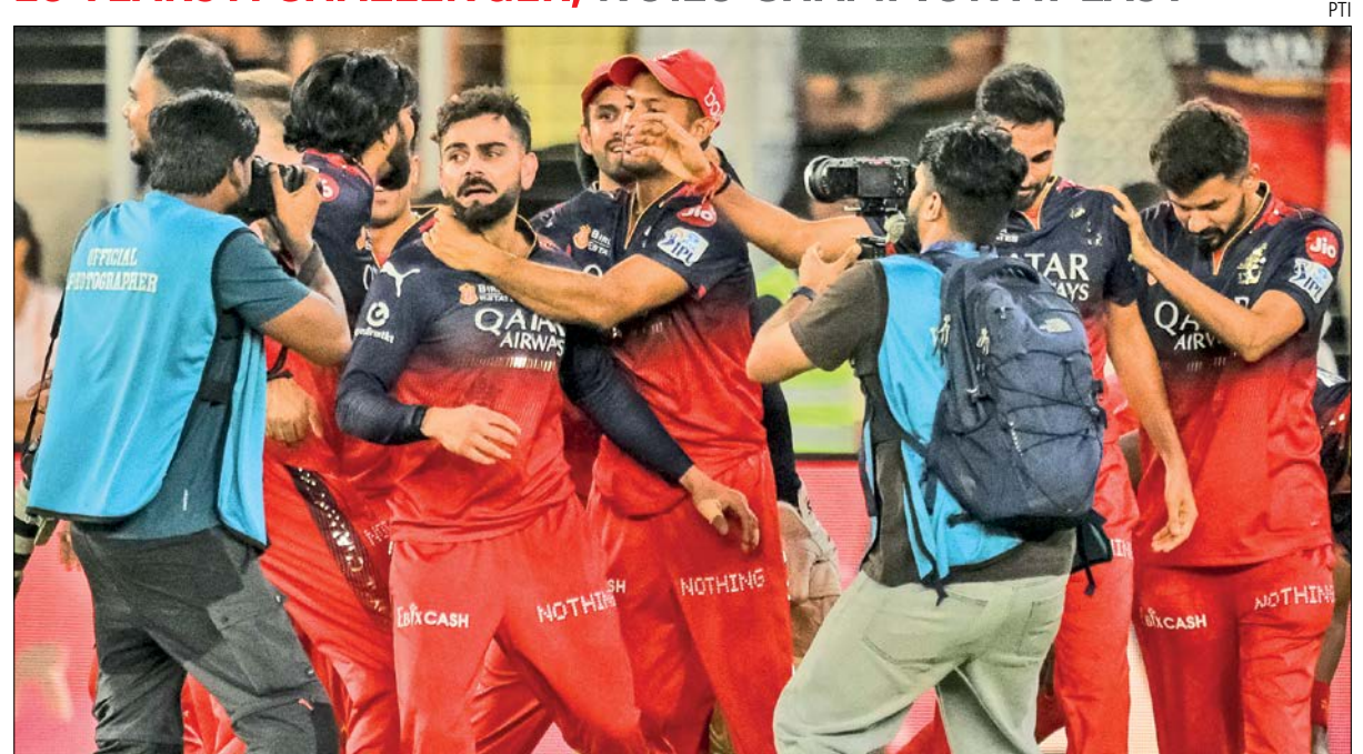
Royal Challengers Bengaluru's players embrace their teammate Virat Kohli after winning their maiden IPL title by defeating Punjab Kings by 6 runs in the IPL 2025 final held in Ahmedabad, on Tuesday. Batting first, RCB scored 190/9, with Virat Kohli top-scoring with 43 runs. Punjab Kings fell short in the chase, managing only 184/7