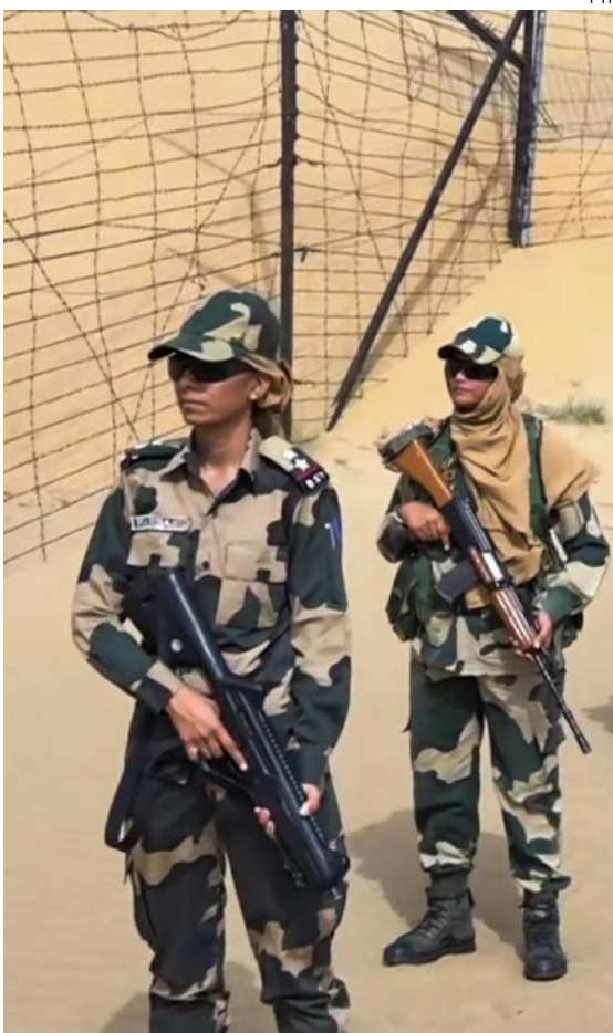
Women BSF personnel patrol the harsh terrain and shifting sands while guarding a border post along the India-Pakistan international border, in Jaisalmer district, Rajasthan, on Sunday