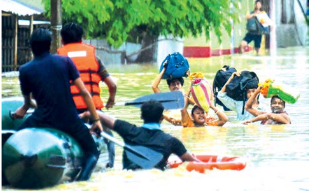
Rescue personnel assist locals in moving to a safer place in Agartala, Tripura

In Tripura, the capital city Agartala witnessed a record-breaking 200 mm of rainfall in just three hours on Saturday night, leading to extensive water-logging and inundation of low-lying areas. One person died after falling into a manhole at Jackson Gate, while another drowning incident was reported in Jirania. Over 10,600 people from 2,800 families were evacuated and housed in 60 relief camps, as three districts — West Tripura, Unakoti, and North Tripura — were heavily affected.