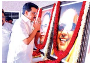
Tamil Nadu Chief Minister M K Stalin pays tribute to his father M Karunanidhi as he arrives to participate in the partys General Body meeting in Madurai