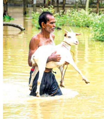
A man carries his goat through a flood-affected area in Assam

people in more than 15 districts have been affected by floodwaters, with 10 major rivers, including the Brahmaputra and Barak, flowing above danger levels. The Central Water Commission (CWC) has issued an orange alert, and the situation continues to deteriorate as rainwater from neighbouring Meghalaya and Arunachal Pradesh swells local rivers. So far, eight deaths have been reported in the state — five due to landslides and three from flooding. Union Home Minister Amit Shah spoke with Assam Chief Minister Himanta Biswa Sarma, assuring central assistance. The Northeast Frontier Railway cancelled or curtailed services in flood-hit areas, and ferry operations between Jorhat and Majuli were suspended. A portion of National Highway-17 in Kamrup district has also