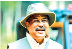
Union Minister Dharmendra Pradhan during a visit to Ushakothi Wildlife Sanctuary, at Badarma in Sambalpur district, Odisha