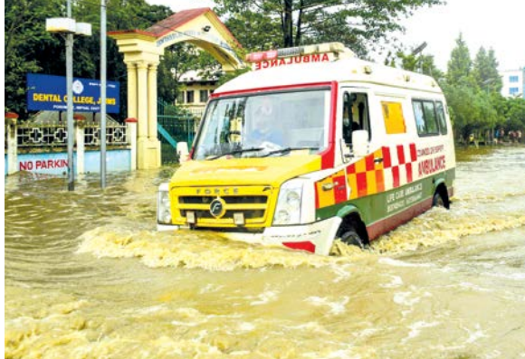
An ambulance moves on a flooded road after heavy rainfall, in Imphal East, Manipur