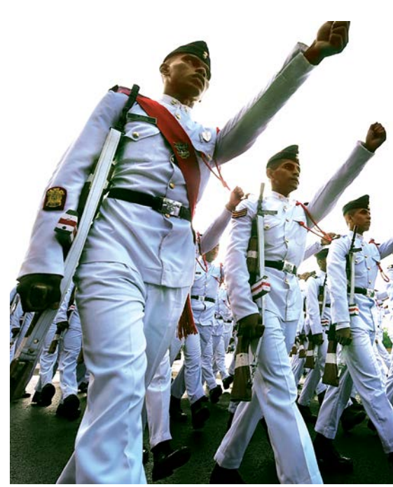
Cadets during a passing out parade of 148th course of the National Defence Academy (NDA), in Pune, Maharashtra