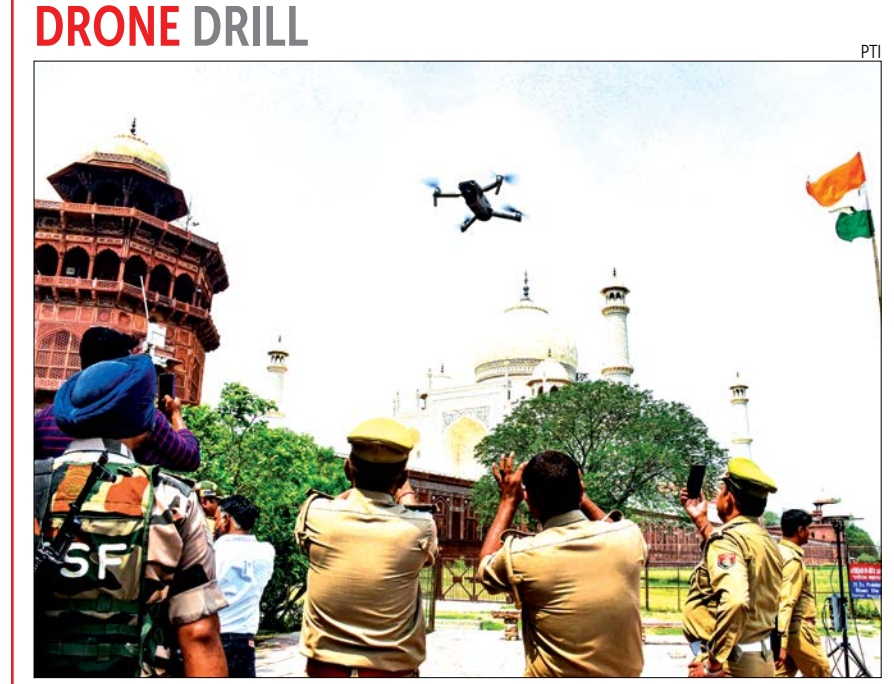
Security personnel conduct an anti-drone mock drill at Dussehra Ghat, near the Taj Mahal, in Agra, Uttar Pradesh

The deputy commissioners gave a comprehensive briefing on several key initiatives taken up for the IDPs to which the governor commended the efforts made and instructed the officials to enhance their initiatives, the statement said.