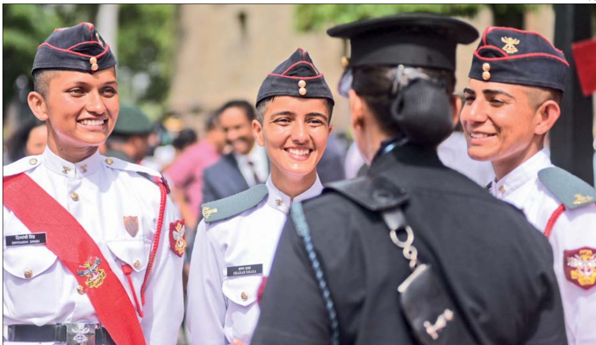
The first batch of women cadets during a passing out parade of 148th course of the National Defence Academy (NDA) in Pune, Maharashtra. In a first, 17 women cadets graduated alongside 322 male counterparts from the NDA, on Friday