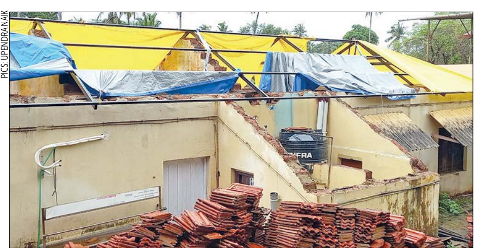
The open roofs of the government primary schools in Taleigao and Chincholem-Bhatlem have left classrooms exposed to rainwater

"The tiles were removed for repairs. The contractor is undertaking repair of two government primary schools at Taleigao and Bhatlem. But till date the contractor has completed the verandah work while the roof work is pending and the contractor is telling us that he needs a crane to