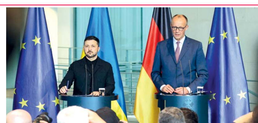
ZELENSKY VISITS BERLIN AS HE SEEKS MORE SUPPORT FOR HIS COUNTRY AP, BERLIN: Ukrainian President Volodymyr Zelensky will meet with new German Chancellor Friedrich Merz in Berlin on Wednesday as Ukraine seeks further military support amid a recent escalation in Russia's bombing campaign, despite US-led efforts to end the war. Germany has been the second-biggest supplier of military aid to Ukraine after the United States. Merz has plunged into diplomatic efforts to try to secure a ceasefire and keep Western support for Ukraine intact since becoming Germany's leader three weeks ago. European leaders have accused Russian President Vladimir Putin of dragging his feet in US-led peace talks. German Foreign Minister Johann Wadephul was set to meet in Washington with US Secretary of State Marco Rubio on Wednesday. Zelensky said Tuesday that Ukraine is ready to hold peace talks at the highest level, including a trilateral meeting with himself, Putin and US President Donald Trump. "We are ready to meet at the level of leaders. Both the American side knows this, and the Russian side knows this," he said.

"Russian armed forces have committed the crimes against humanity of murder and the war crimes of attacking civilians, through a months-long pattern of drone attacks targeting ci-