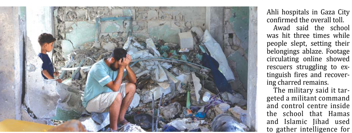
A man sits amid the rubble at the Fahmi Al-Jarjawi School in Gaza City on Monday, following an Israeli strike

Israel began allowing a trickle of humanitarian aid into Gaza last week after blocking all food, medicine, fuel or other goods from entering for 2 \frac{1}{2} months. Aid groups have warned of famine and say the aid that has come in is nowhere near enough to