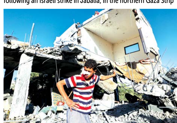
A Palestinian boy stands outside a destroyed house that was targeted in an Israeli strike at the Nuseirat camp for refugees in

to seize full control of Gaza and facilitate what it describes as the voluntary migration of much of its Israel also says it plans population of over 2 million