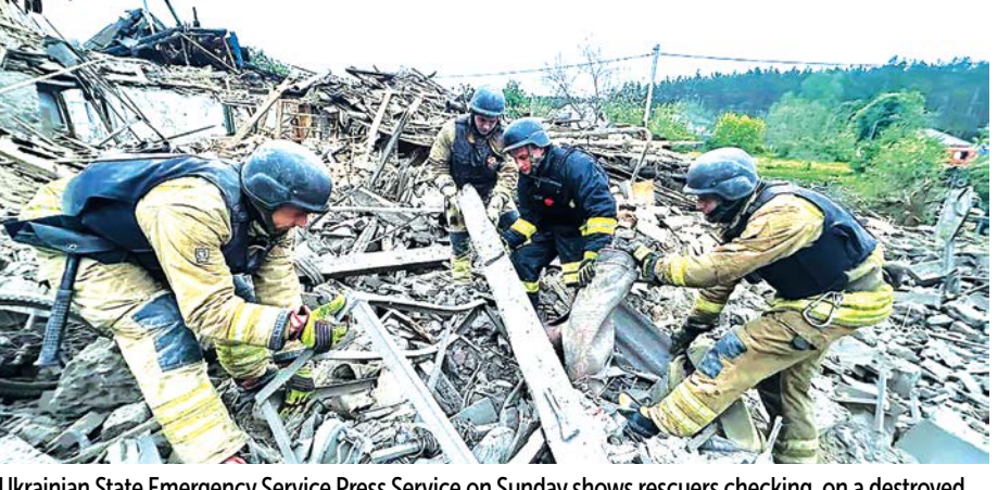
Ukrainian State Emergency Service Press Service on Sunday shows rescuers checking on a destroyed private house following Russian strike in Zhytomyr Region, amid Russian invasion in Ukraine

There was no immediate comment from Moscow.