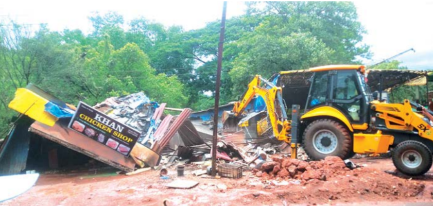
An earthmover in action during the demolition of illegal structures at Curti

Panch Bika Kerkar recalled that an earlier at-