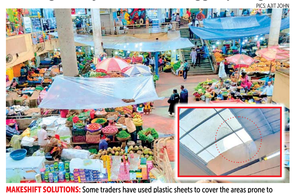
water seepage in the Panjim municipal market. (Inset) the damaged portion of the roof

Shoppers, vendors continue to grapple with roof leakage, filthy toilets & waterlogged passages