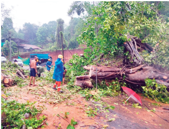
पेडणे : झाड मोकळे करताना पेडणे अग्रिशम दलाचे जवान व नागरिक.