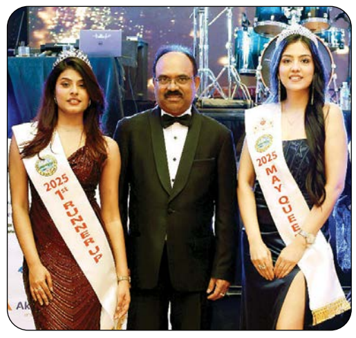
25TH ANNUAL MAY QUEEN BALL IN QATAR