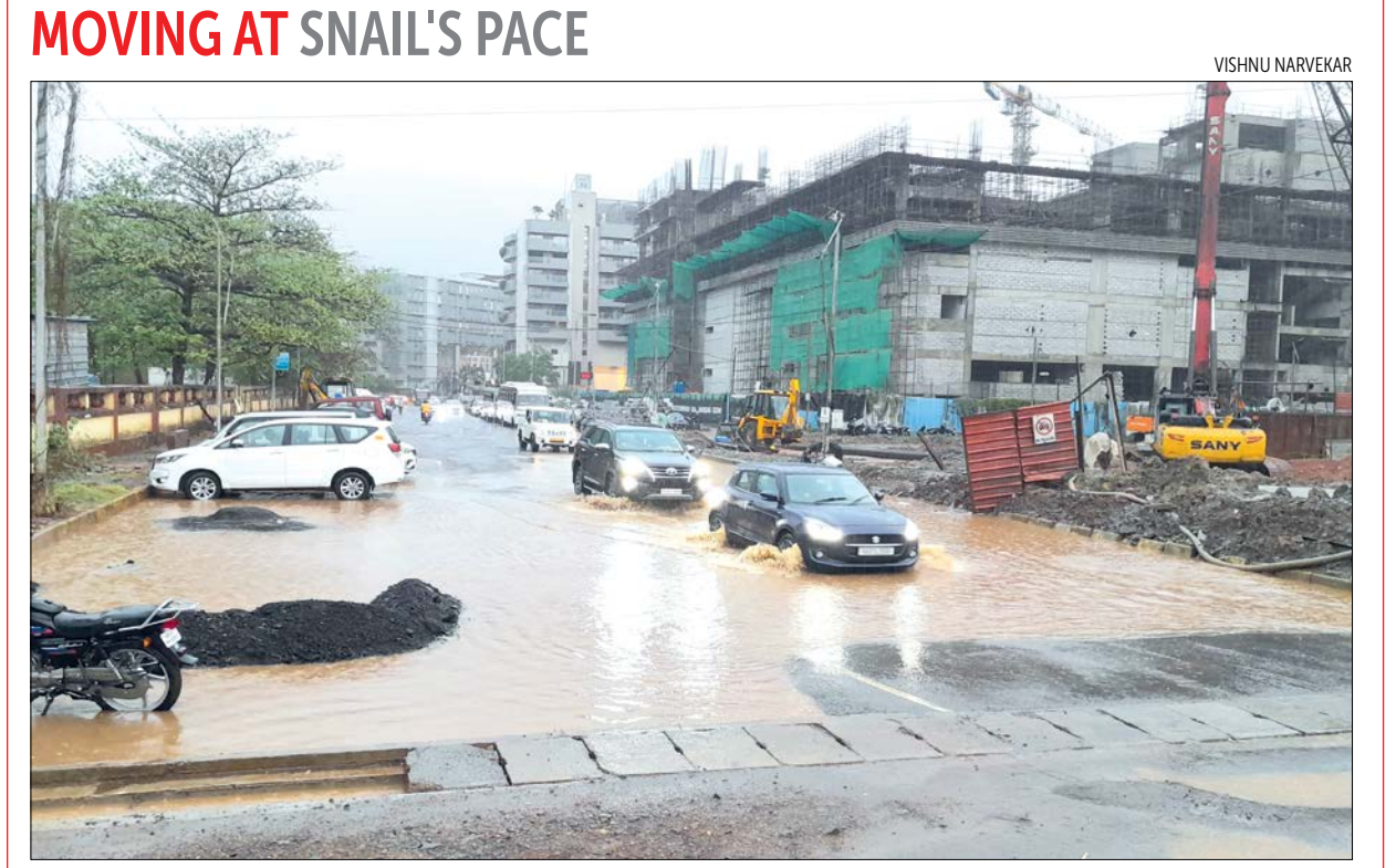
Vehicles commute along a flooded road at Patto-Panjim on Tuesday, following heavy showers that lashed the State

These incidents have raised serious concerns about safety protocols and the negligence of the electricity department, with residents calling for stricter safety measures for field staff