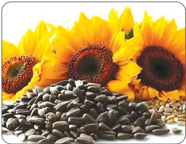
SUNFLOWER SEEDS: A TINY NUTRITIONAL POWERHOUSE