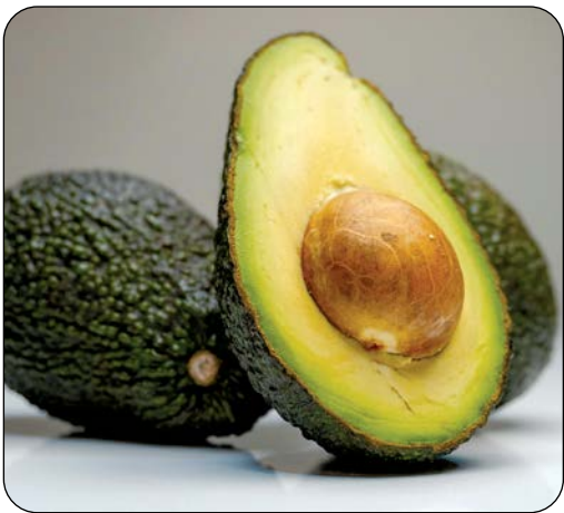
FIVE HEALTHY HIGH-FAT FOODS