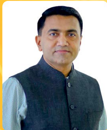
Dr Pramod Sawant Hon'ble Chief Minister of Goa