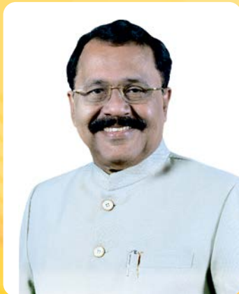
Shri P.S. Sreedharan Pillai Hon'ble Governor of Goa