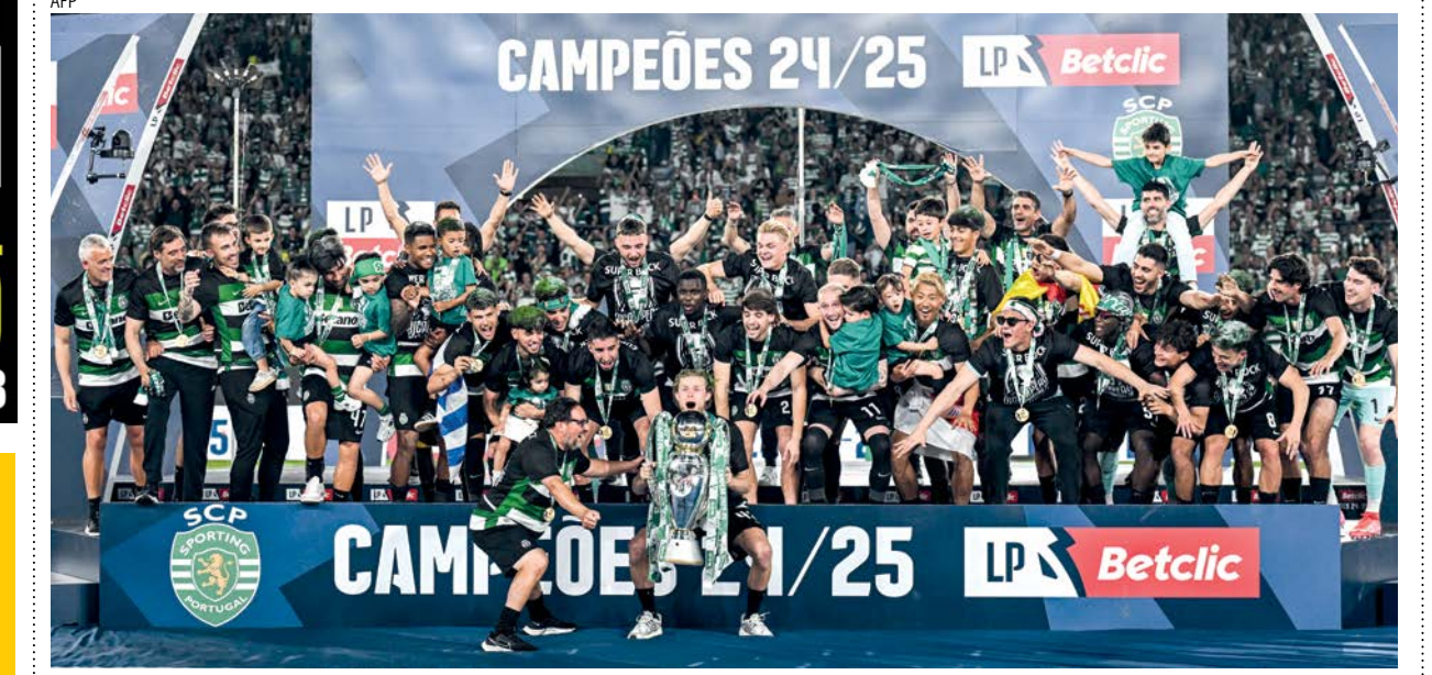
Sporting Lisbon's players celebrate their title after the Portuguese League football match between Sporting CP and Vitoria Guimaraes SC at Jose Alvalade stadium in Lisbon

AFP, LISBON: Sporting Lislast weekend left the title bon defended their Porturace on a knife edge.