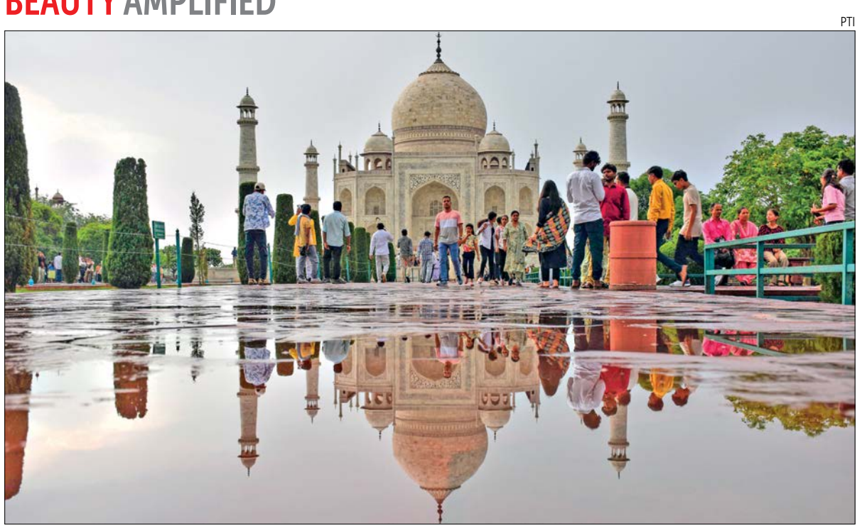
The Taj Mahal is reflected on its wet premises after rainfall, in Agra, Uttar Pradesh, on Saturday