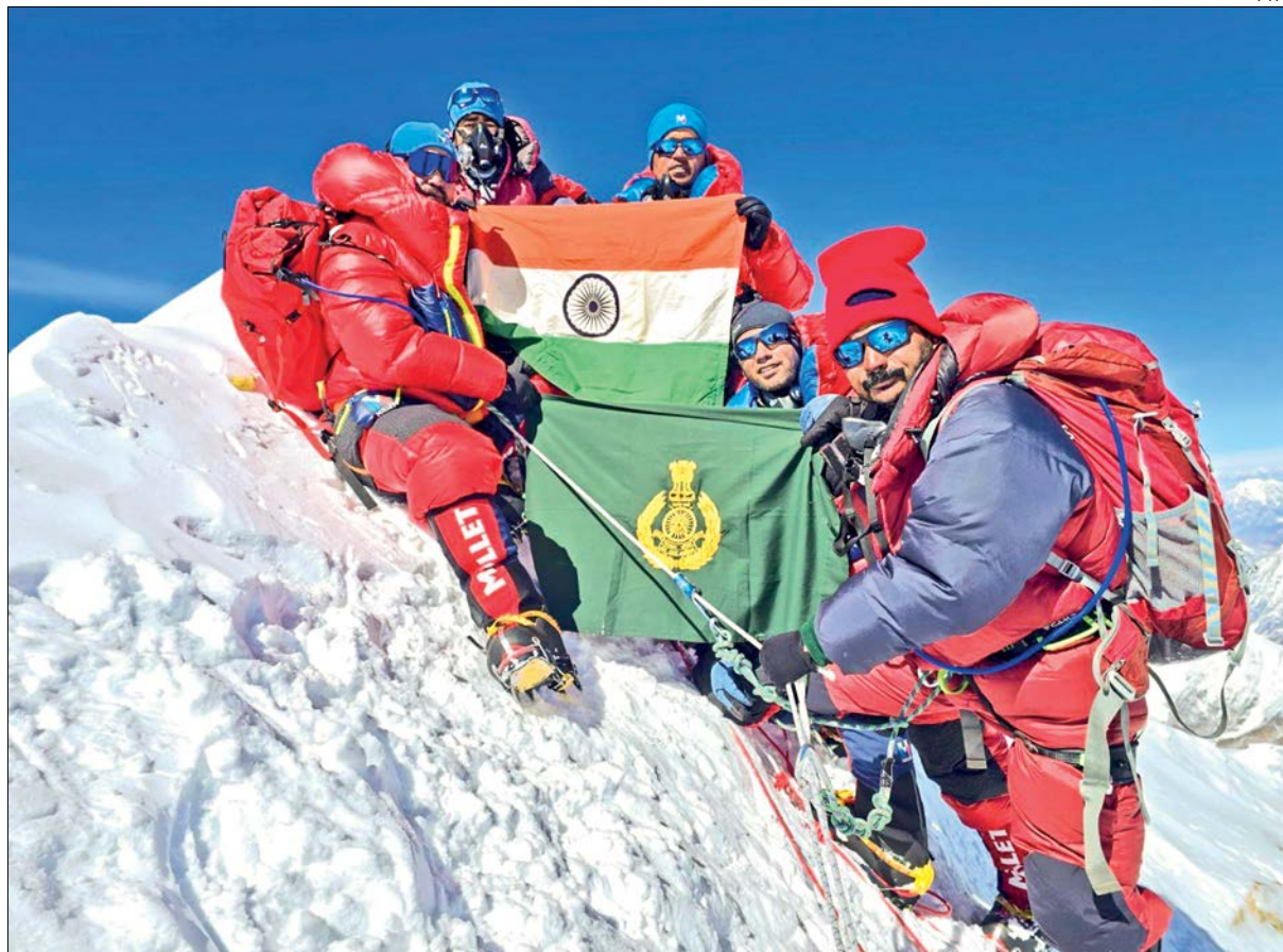
ITBP jawans upon reaching the summit of Mount Makalu, the fifth highest peak in the world, on Friday