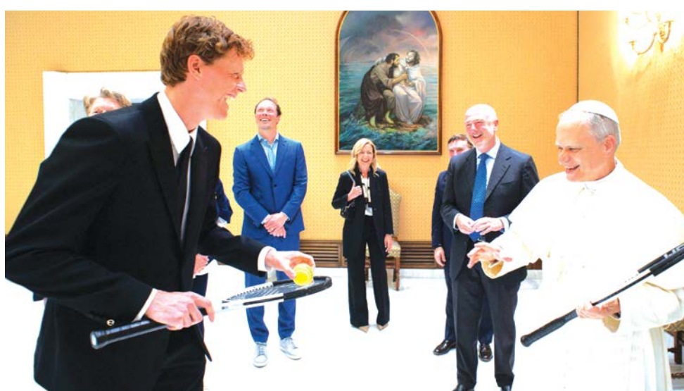
Pope Leo XIV shares a light moment with Italian tennis star Jannik Sinner during a private audience at the Vatican

"It's an honour," Sinner said in Italian as he and his parents arrived in a reception room of the Vatican's auditorium. Holding one of his rackets and giving Leo