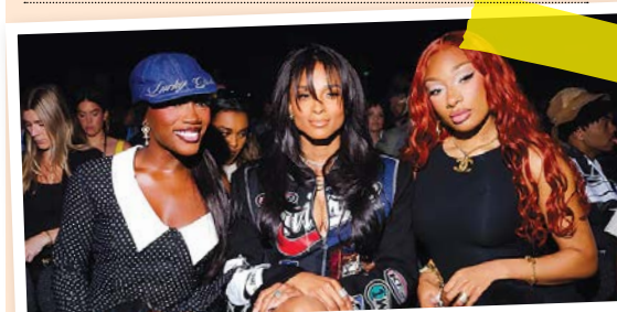
Doechii, Ciara and Megan Thee Stallion attend the party at the Airbnb 2025 Summer Release event in Los Angeles.