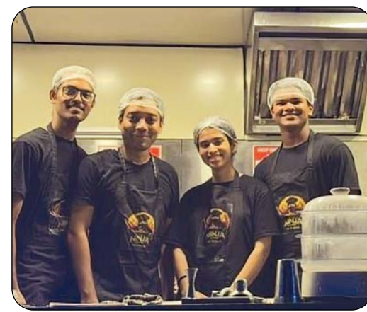
KAMAXI COLLEGE OF CULINARY ARTS STUDENTS INTERN AT A FOOD TRUCK