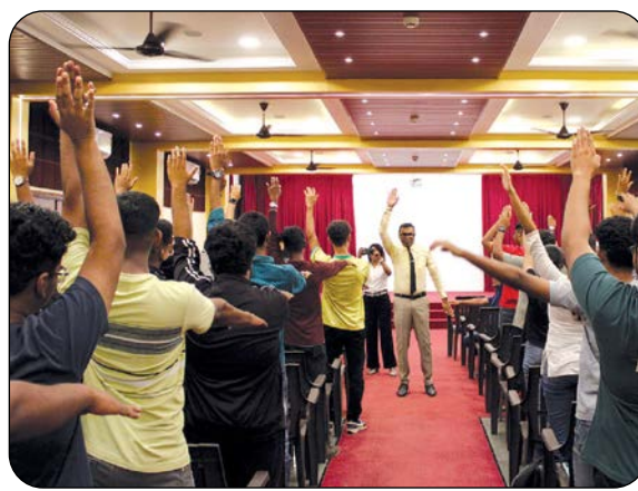
AAVISHKAR 2025 IGNITES ENTREPRENEURIAL SPIRIT AT PCCE, VERNA