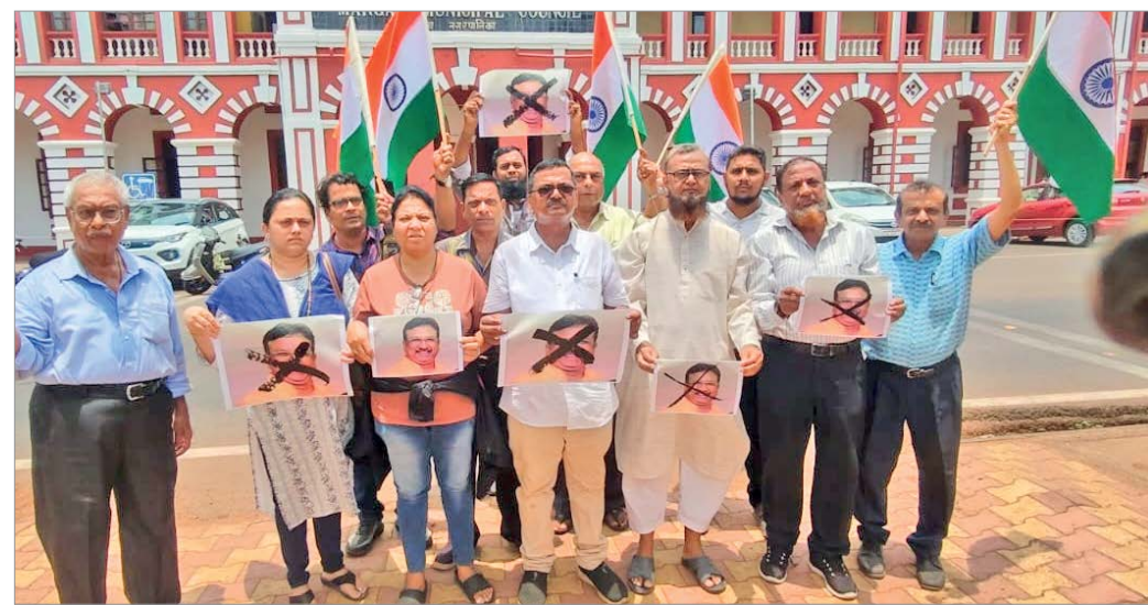
Congress functionaries and local activists hold up defaced photos of Madhya Pradesh Minister Vijay Shah during a protest held outside the Margao Municipal Council on Wednesday. The group demanded that he be sacked and arrested for his communal remarks against an Indian army colonel