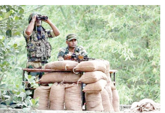
Security forces, maintain a strict vigil at Karegutta Hills in Chhattisgarh amid ongoing anti-Maoist operations

The officials said that after analysing facts and informa-