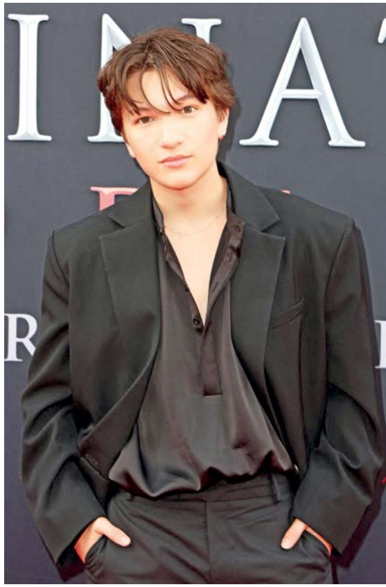
British-US actor Teo Briones attends the world premiere of Warner Bros "Final Destination Bloodlines" at the TCL Chinese Theatre in Hollywood, California

Bomb scare on plane halts operations at Belgian airport BRUSSELS: Operations at Belgium's second largest airport were briefly suspended on Tuesday due to a bomb alert on a Ryanair flight from Portugal, the company running the airport and the airline said. Shortly before 11:00 am (0900 GMT) "a bomb threat was triggered" on board an aircraft that landed at Charleroi airport, said a spokeswoman for its operator. "A security perimeter was established around the aircraft," the spokeswoman said. This required the runway to be closed as authorities took over, halting operations, she added. Air traffic eventually resumed at 1:45 pm.