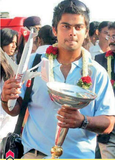
2008 - THE YOUNG CRICKETER MAKING HIS MARK At 19, Virat sported a clean-shaven face and short spiky hair. His fashion sense was simple and practical as he was more focused on his game.

Virat Kohli's transformation from a young Delhi cricketer to a global fashion icon perfectly illustrates how his style and self-expression have evolved