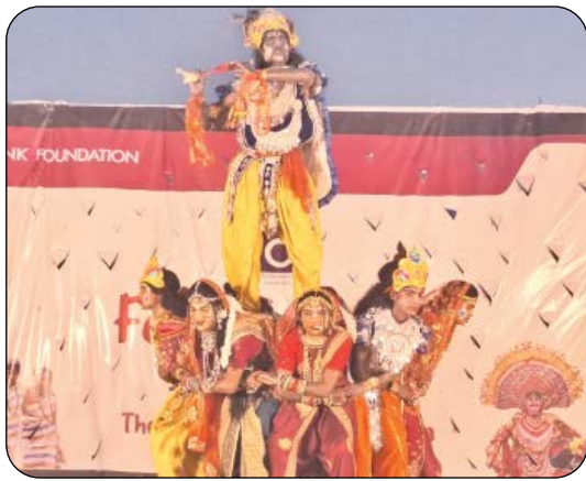
FOLK DANCES OF JHARKHAND AND ODISHA IN GOA