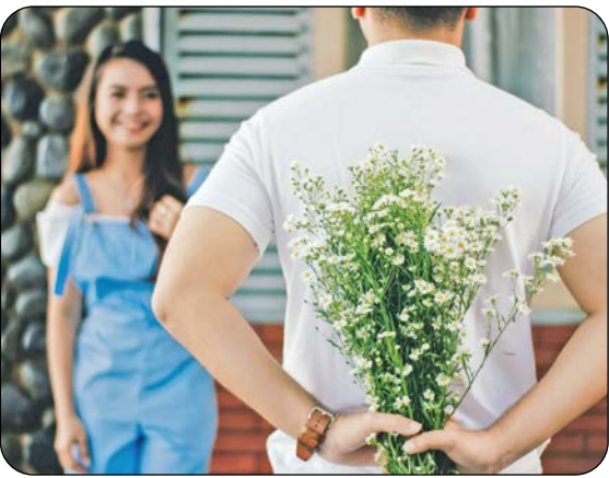
RED FLAGS TO WATCH OUT FOR IN A RELATIONSHIP