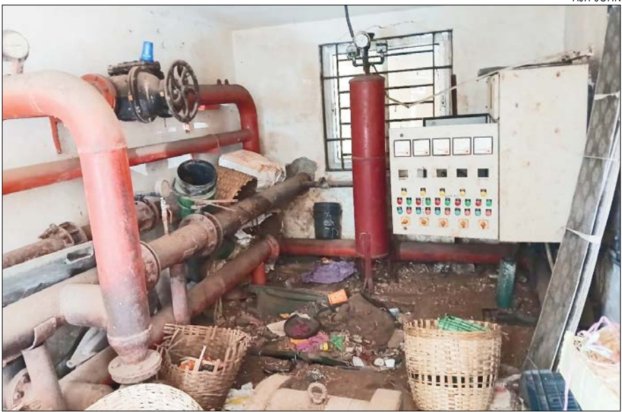
The fire hydrant station in an utter state of neglect