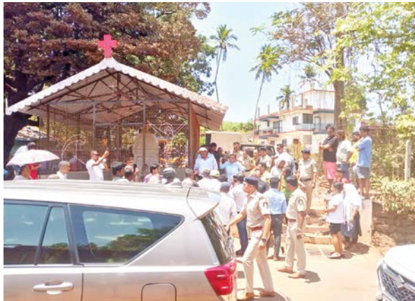
UNITED THEY STAND: Protesters refused to budge, opposed the road widening and demanded the contractor produce a work order

Locals strongly condemned the attitude of the