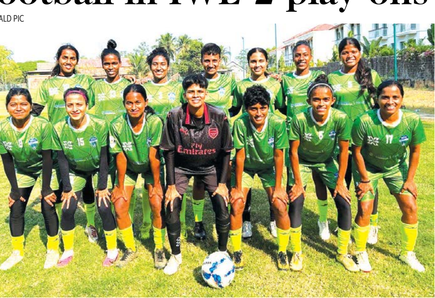
football in India.

In their first-ever appearance in IWL2. the Sesa FA senior women's team, also known as the #SFALionesses, have turned heads with their aggressive playmaking, rock-solid defence, and