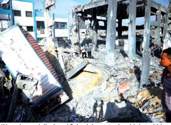
A UN worker and displaced Palestinians stand amid the rubble of an UNRWA aid supply depot and shelter, heavily damaged in an overnight Israeli strike in Jabalia in the northern Gaza Strip

Among the 23 bodies brought to hospitals over the past 24 hours were those of the family of five whose tent was struck in Gaza City's Sabra district, Gaza's Health Ministry said. Another Israeli strike