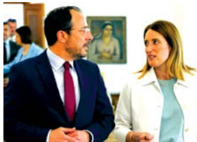
Cyprus' President Nikos Christodoulides walks with European Parliament Prez Roberta Metsola ahead of their meeting at the Palace in Nicosia