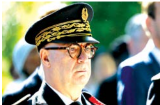
Prefect Philippe Le Moing-Surzur and Prefect Baptiste Rolland attend a ceremony at the Luxembourg garden in Paris