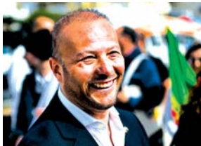
CHEGA far-right party's lawmaker, Joao Paulo Graca smiles during a party's electoral campaign action at Quarteira market in Algarve