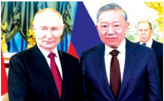
Russia's President Vladimir Putin (L) shakes hands with the General Secretary of the Communist Party of Vietnam Tô Lâm in Moscow