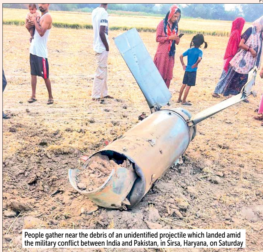
People gather near the debris of an unidentified projectile which landed amid the military conflict between India and Pakistan, in Sirsa, Haryana, on Saturday

After a long night of talks mediated by the United States, I am pleased to announce that India and Pakistan have agreed to a FULL AND IMMEDIATE CEASEFIRE. Congratulations to both Countries on using Common Sense and Great Intelligence