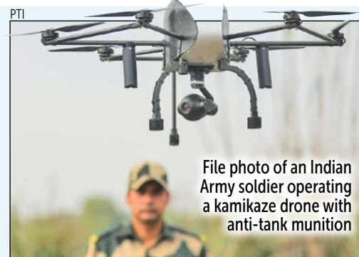
File photo of an Indian Army soldier operating a kamikaze drone with anti-tank munition