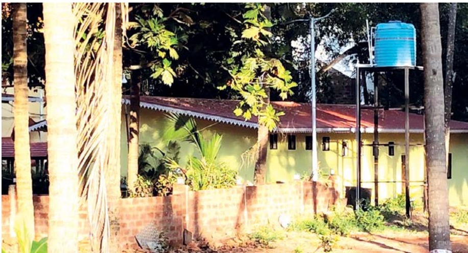
Structures built within protected area. These structures were built in November 2024, ahead of decennial Exposition

In its notice dated May 8, 2025, the ASI stated: "It is observed by the undersigned that the encroachment; construction in laterite stone which is within protected area from the Centrally Protected Monument: Basilica of Bom Jesus, Old Goa. The said monument and its premises are nationally importance and duly protected