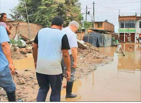
Pope Leo XIV's Indian visits, marked by humility, prayer, and pastoral care, continue to inspire those who met him and bear testimony to the deeply spiritual nature of his leadership