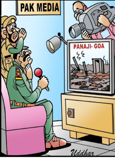
We didn't destroy it, that's just an ongoing Smart City project