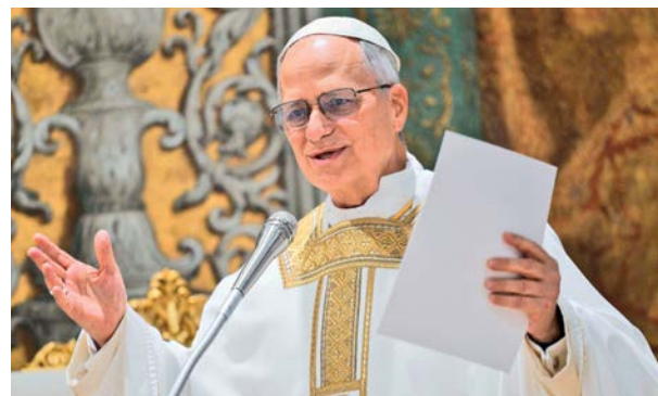
Pope Leo XIV during a mass with cardinals in the Sistine Chapel in The Vatican, on Friday

dense homily on the need to joyfully spread Christianity in a world that often mocks it.