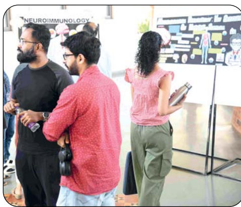
BITS PILANI, GOA, OBSERVES INTERNATIONAL DAY OF IMMUNOLOGY 2025