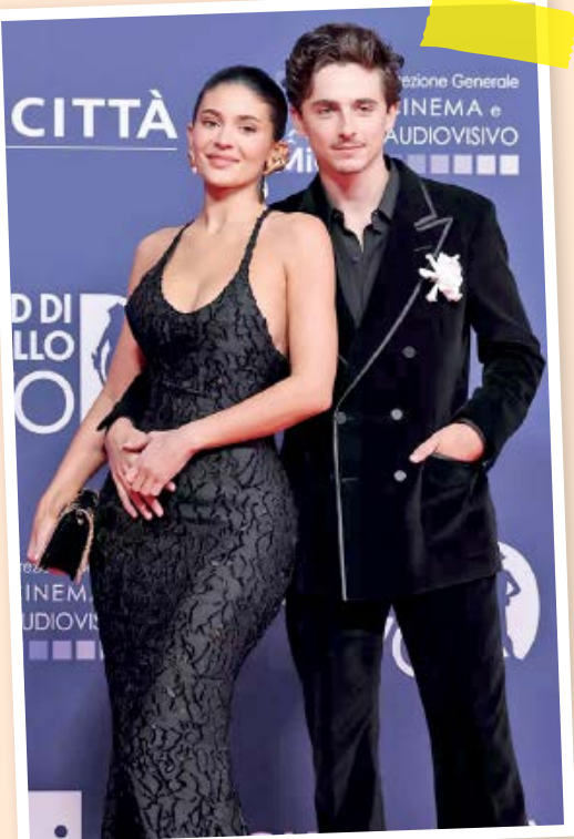
Kylie Jenner and Timothée Chalamet finally make their red carpet debut at the 70th David Di Donatello awards in Rome, Italy after been romantically linked since 2023. Timothée was honoured with a David Award – the Italian equivalent of the Academy Award

Jackie Chan isn't one to back down from a physical challenge. The 'Karate Kid: Legends' star, 71, is known for his action-packed movie roles, with his latest project being no different. Chan said he has no immediate plans to the contrary. "Of course, I always do my own stunts. It's who I am. That's not changing until the day I retire, which is never!" he said with a laugh. Chan added, "When you've done it for 64 years straight, there's no physical preparation anymore," he explained. "Everything is in your heart and soul; it is muscle memory."