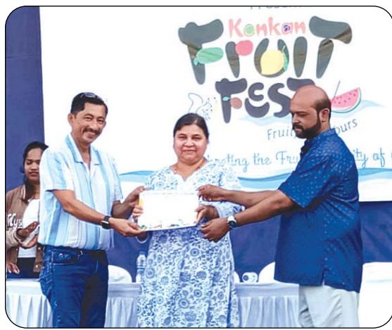
GOA CELEBRATES NATURE'S BOUNTY AT THE 19TH KONKANI FRUIT FEST