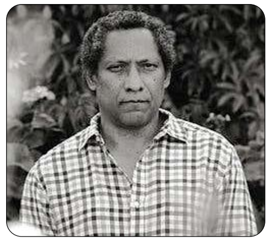
THE 2025 PULITZER PRIZE WINNING BOOKS