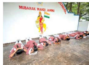
School students in Jammu actively took part in a mock drill conducted to raise awareness and preparedness for earthquake emergencies