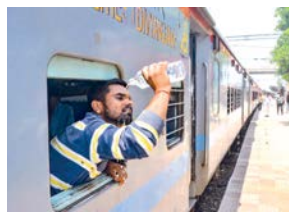
A passenger pours cold water on his face to cool off during a hot summer day, at Vindhychal railway station