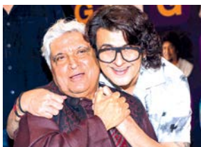
Screenwriter and lyricist Javed Akhtar with singer Sonu Nigam during the launch of 'Goongoonalo' music app