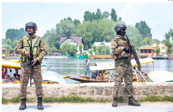
Security personnel stand guard near Dal Lake amid high alert, in Srinagar