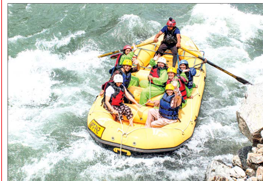
Tourists enjoy an adventurous river rafting experience near Manali, located in the scenic Kullu district of Himachal Pradesh