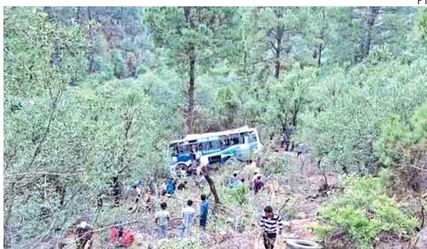
Locals reached the site of the incident after a private bus skidded off the road and fell into a deep gorge

PTI, MENDHAR: Four passengers including a soldier were killed and 44 others injured when a private bus skidded off the road and plunged into a deep gorge in Jammu and Kashmir's Poonch district on Tuesday, officials said.