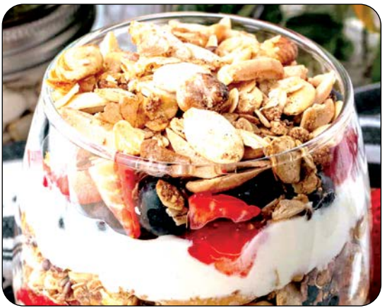
TOP 5 SUMMER SNACKS TO STAY COOL