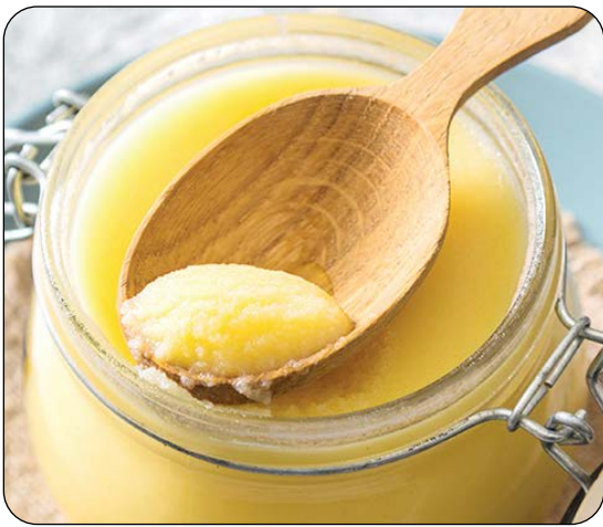
THE MAGIC OF WARM GHEE WATER