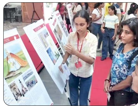
BL CARLOS EUCHARISTIC MIRACLES EXHIBITION DRAWS FAITHFUL TO AQUERM