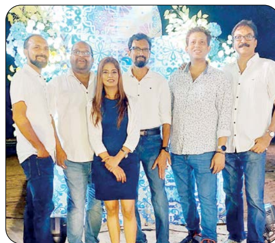
PURPLE RAIN TURNS 40