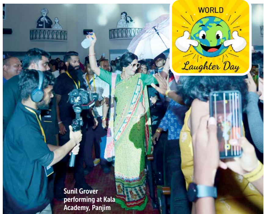
Sunil Grover performing at Kala Academy, Panjim

What makes us laugh? A funny quip that helps us understand that we are not the only ones with these shared humorous experiences. With stand-up comedians from all across the country travelling to Goa for small as well as auditorium full shows, it goes to confirm that Goa is ready for a good laugh. Each artiste comes with his/her own individual style and thanks to social media that gives ten seconds of laughter doses, the audience is familiar with their content, making it easier to book tickets for the latest laughter riot in town.