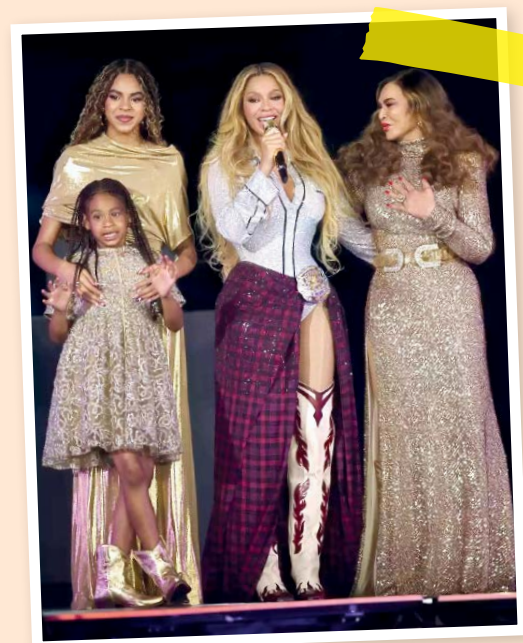
Tina Knowles joined Beyoncé and granddaughters, Blue Ivy and Rumi on stage at Cowboy Carter Tour in the US as they celebrated Tina becoming a New York Times bestseller after memoir 'Matriarch' tops the hardcover nonfiction list.

Shah Rukh Khan ranks fourth among the world's richest actors in 2025. His estimated net worth is reported to be $876.5 million. Topping the list is Arnold Schwarzenegger with $1.49 billion, followed by Dwayne 'The Rock' Johnson at $1.19 billion, and Tom Cruise at $891 million. George Clooney takes the fifth spot with $742.8 million. The other Hollywood icons in the list includes Brad Pitt, Tom Hanks, Jackie Chan, Robert De Niro and Jack Nicholson. Shah Rukh Khan was last seen in the 2023 film Dunki, directed by Rajkumar Hirani. The actor will be next seen in Sujoy Ghosh's 'King'.